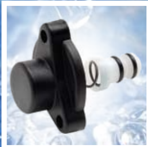
Precision bypass system provides constant outlet pressure