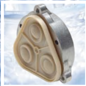
One-piece piston-diaphragm maximizes pump life

With the High Performance Brushless-D.C. R.O. Booster Pump SHURflo once again pushes the envelope in the market. The SHURflo high performance pump-head and its proven reliability is complemented with a high efficiency, long life Brushless-D.C. motor, which makes this a versatile work-horse R.O. pump. Ideal for high pressure / high flow applications. The motor is robustly built to handle the demanding requirements of commercial R.O. systems.