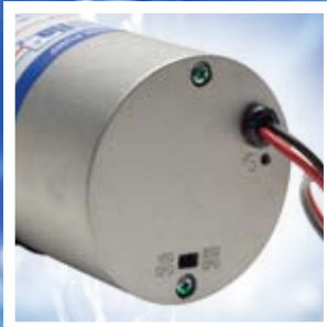
2 speed selector-switch allows instant change of pump performance.