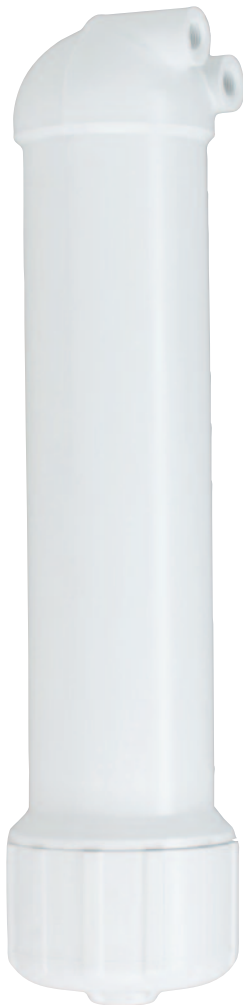
Membrane Housing with 90° Outlet

The PENTEK RO Membrane Housing is manufactured from a high-quality polypropylene.