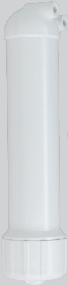
Membrane Housing with 90° Outlet