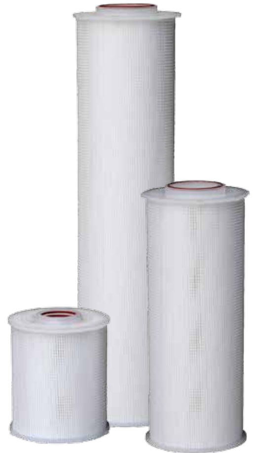
Premium Hurricane® All-Poly Cartridges