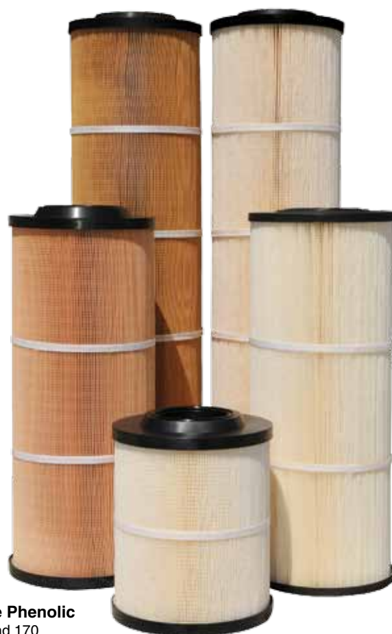
Cellulose Phenolic 90 and 170