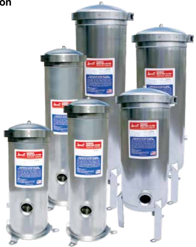
Models BC4-1, BC4-2, BC4-3, BC6-1, BC6-2, BC6-3

316 stainless steel Sanitary, BSTP or victaulic connections