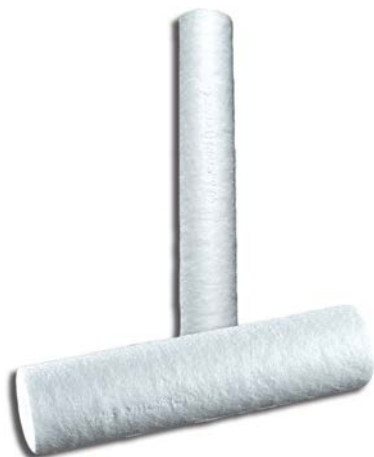
Figure 1: Purtrex Depth Cartridge Filters