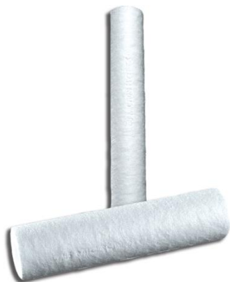
Figure 1 : Hytrex Depth Cartridge Filters